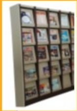
PERIODICAL DISPLAY RACKS