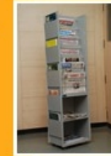
MAGAZINE & NEWSPAPER DISPLAY RACKS