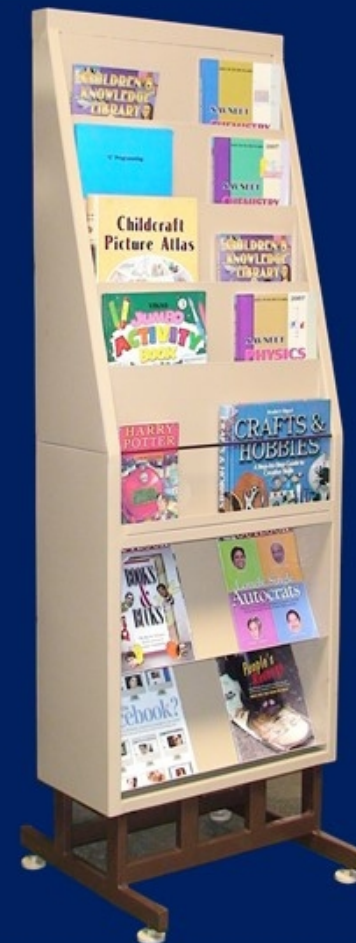
NEW MAGAZINES ARRIVAL STAND