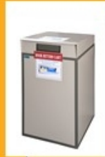
BOOK RETURN CART