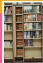
SIDE TO SIDE MOVABLE RACK