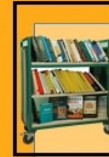
ECONOLINE BOOK TRUCKS