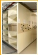
MODULAR COMPACTOR STORAGE SYSTEM