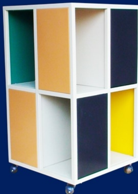
TROLLEY BOOK DISPLAY